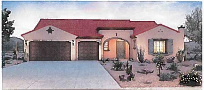
Elevation "A" Spanish