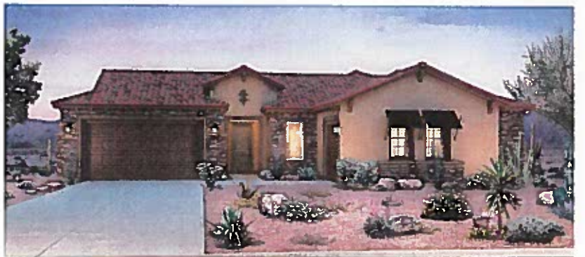
Elevation "C" Tuscan