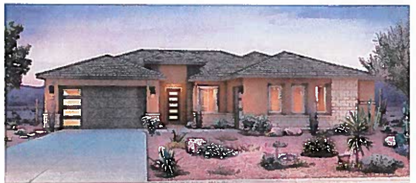
Elevation "D" Desert Prairie