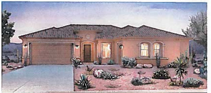
Elevation "B" Italian