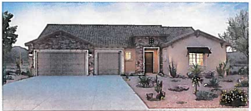
Elevation "C" Tuscan