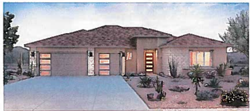
Elevation "D" Desert Prairie