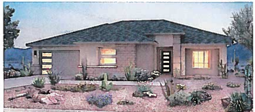
Elevation "D" Desert Prairie