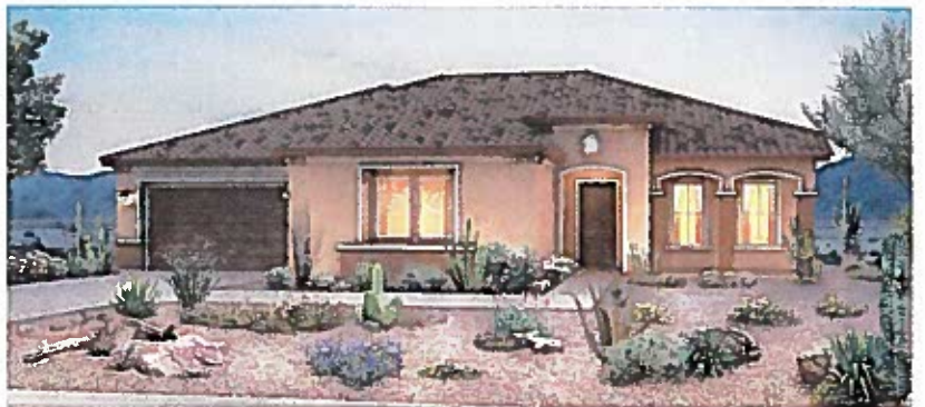
Elevation "B" Italian