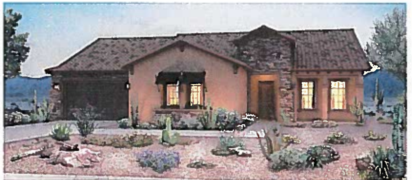
Elevation "C" Tuscan