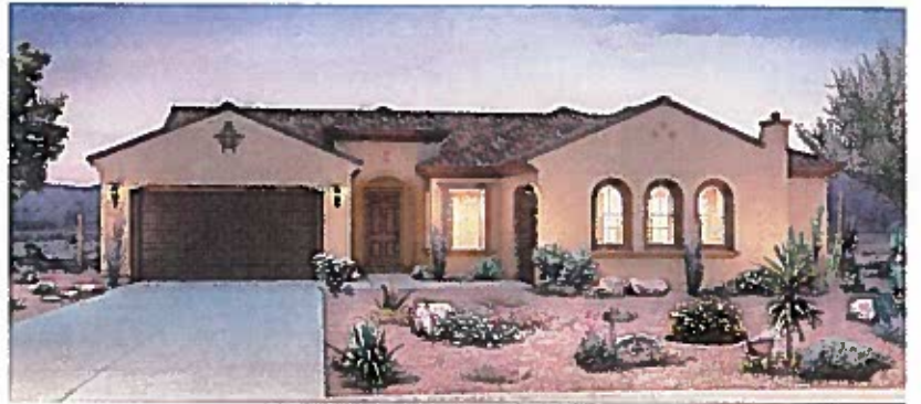
Elevation "A" Spanish