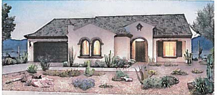
Elevation "A" Spanish