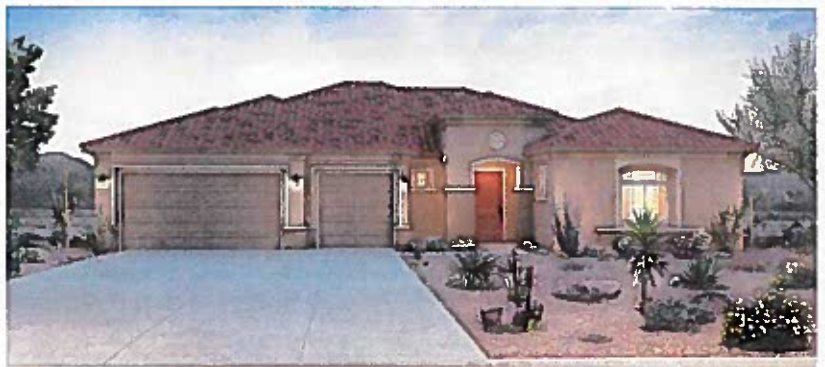
Elevation "B" Italian