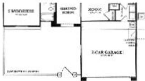
OPTIONAL 4' HIGH COURTYARD WALL WITH GATE