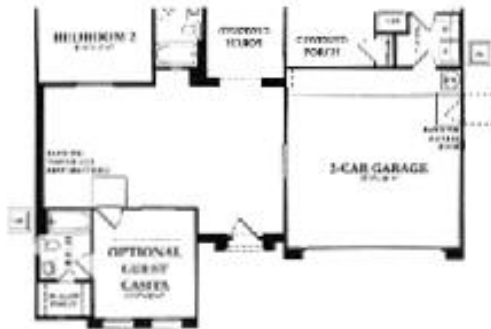
OPTIONAL FULL HEIGHT OR 4' COURTYARD WALL WITH GUEST CASITA

GREAT ROOM, BREAKFAST NOOK, 2 BEDROOMS, DEN, 2 BATHS, 2-CAR GARAGE, COVERED PATIO LIVABLE AREA: 1,811 SQUARE FEET