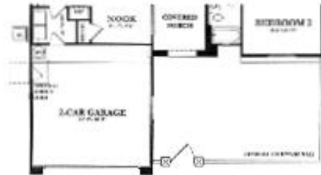
OPTIONAL 4' HIGH COURTYARD WALL WITH GATE