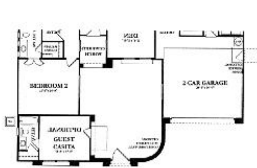
OPTIONAL FULL HEIGHT OR 4' COURTYARD WALL WITH GUEST CASITA

GREAT ROOM, BREAKFAST NOOK, WET BAR, 2 BEDROOMS, DEN, 2.5 BATHS, 2-CAR GARAGE, CART GARAGE, COVERED PATIO LIVABLE AREA: 2,560 SQUARE FEET