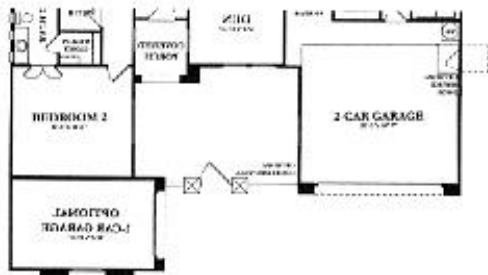
OPTIONAL 4' HIGH COURTYARD WALL WITH GATE