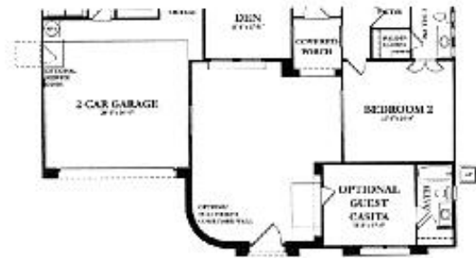
OPTIONAL FULL HEIGHT OR 4' COURTYARD WALL WITH GUEST CASITA