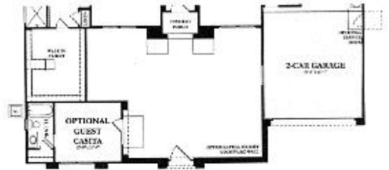
OPTIONAL FULL HEIGHT COURTYARD WALL WITH DOOR AND CASITA