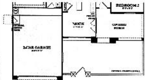
OPTIONAL 4' HIGH COURTYARD WALL WITH GATE