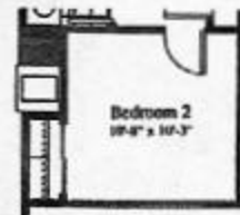
Optional Bedroom 2